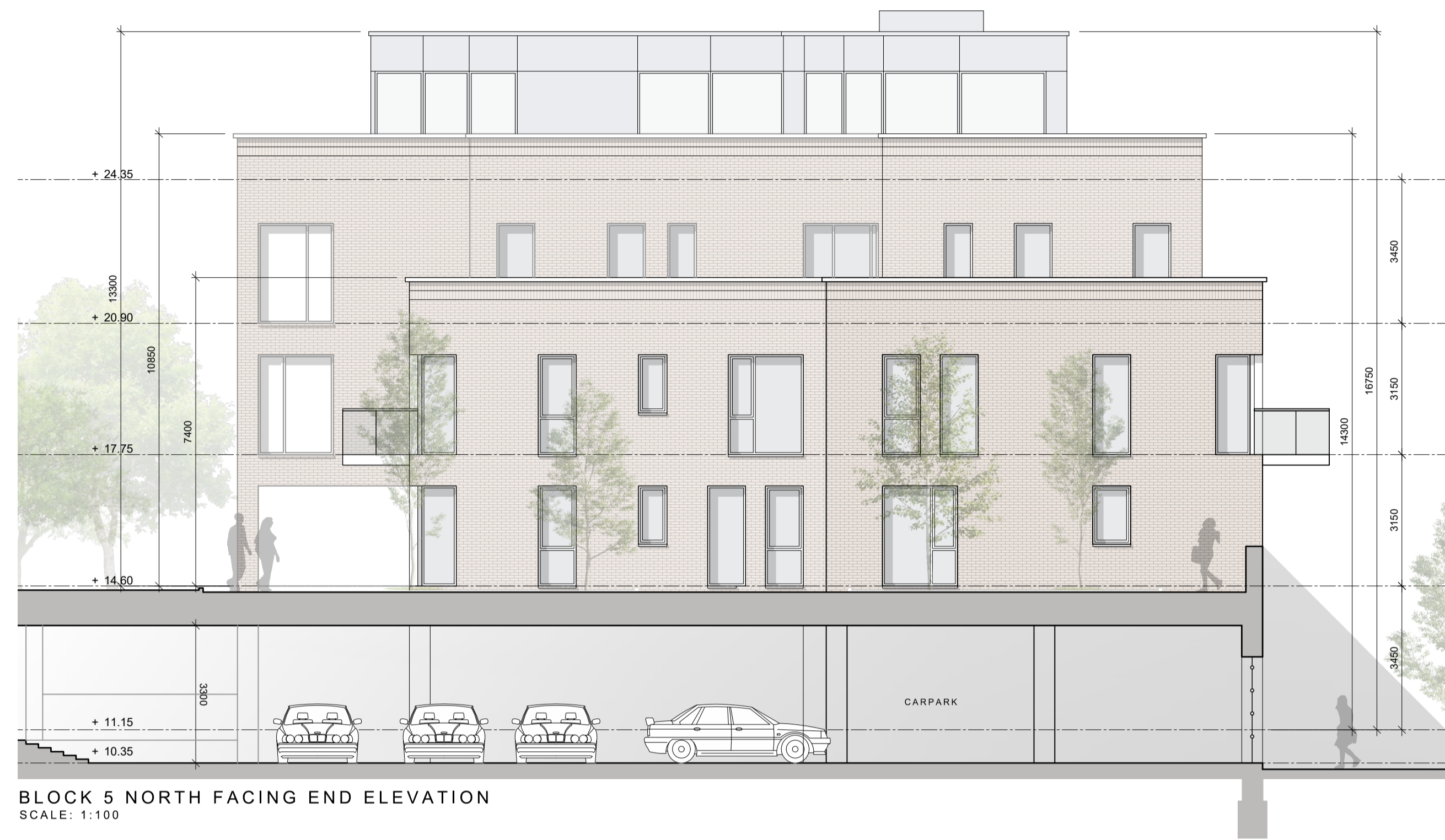
BLOCK 5 NORTH FACING END ELEVATION SCALE: 1:100