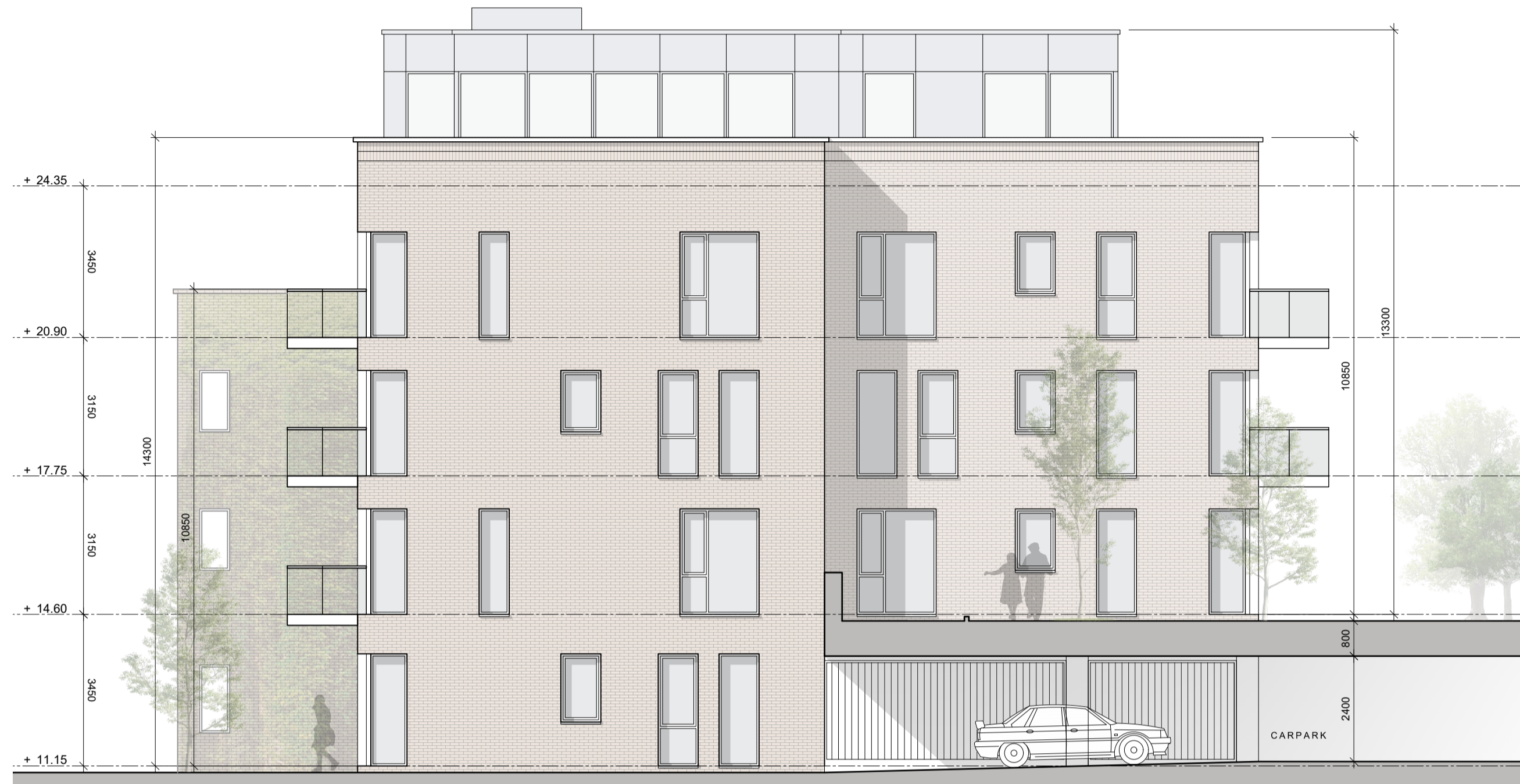
BLOCK 5 SOUTH FACING END ELEVATION SCALE: 1:100