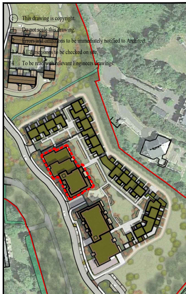
KEY PLAN INDICATING POSITION OF APARTMENT BLOCK 5 NOT TO SCALE